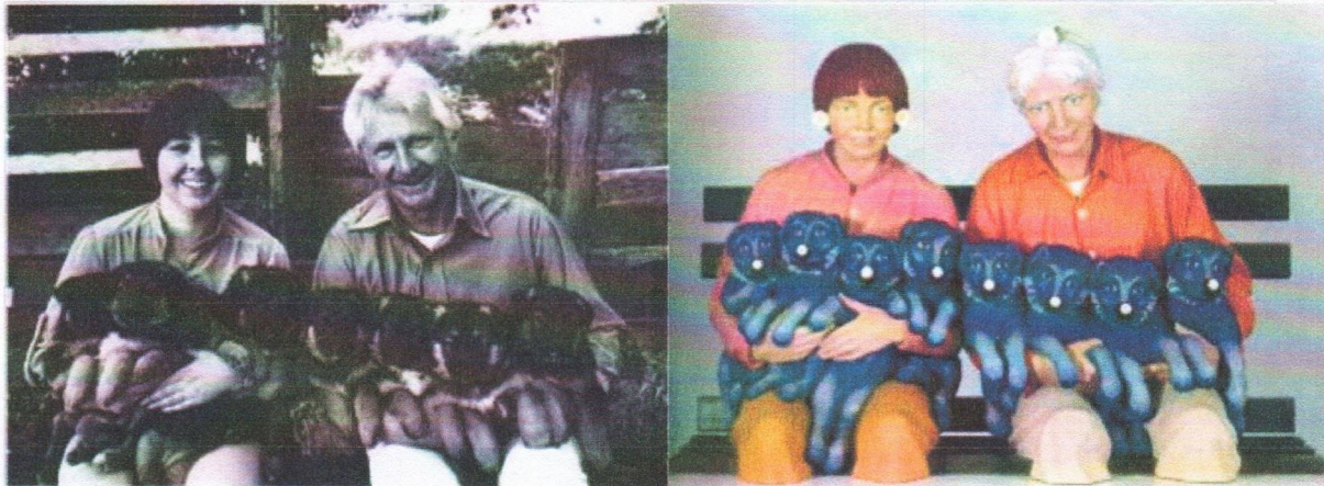
Left: Art Rogers, Puppies , 1985. Right: Jeff Koons, String of Puppies , 1988

As a reference, below are high profile examples of alleged visual plagiarism that led to legal challenges in the U.S.